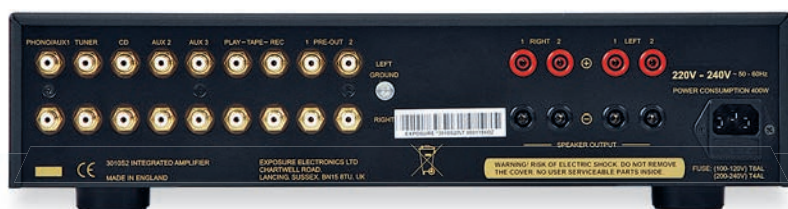
ABOVE: In addition to six RCA line inputs, the Exposure's back panel offers two sets of preamp outputs for bi-wiring, and two pairs of speaker outputs, plus IEC mains in